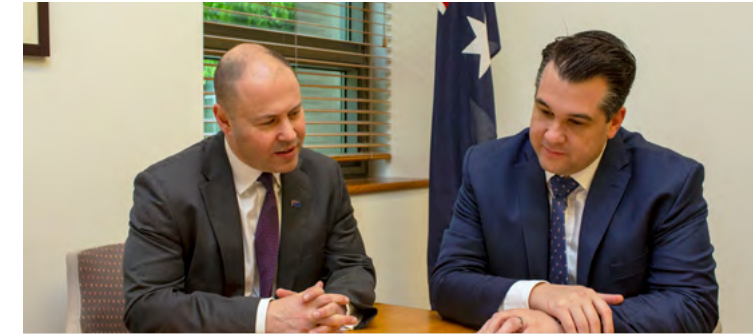
Budget preparations with Treasurer Josh Frydenberg

The Morrison Government's Economic Recovery Plan will create jobs, rebuild our economy and secure Australia's future.