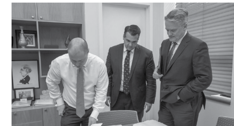
Preparing for Budget 2020 with Treasurer Josh Frydenberg and Finance Minister Mathias Cormann

At the last election I secured funding from the Federal Government to provide a new multi-level carpark at Croydon train station. With the easing of Covid-19 restrictions, it is very exciting to see site works commencing! The carpark will be constructed on Council owned land at Devon Street, Croydon and is expected to be completed by October 2021. Maroondah City Council will provide alternative carparking arrangements in Croydon, as required, during construction.