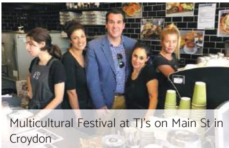
Multicultural Festival at TJ's on Main St in Croydon