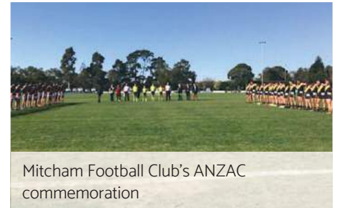
Mitcham Football Club's ANZAC commemoration