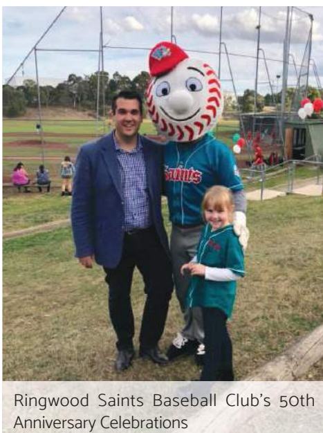
Ringwood Saints Baseball Club's 50th Anniversary Celebrations