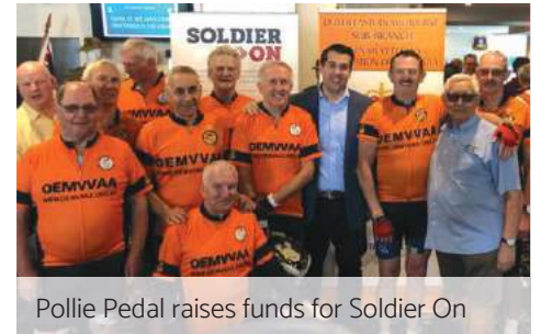
Pollie Pedal raises funds for Soldier On