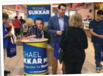
Michael Sukkar MP Federal Member for Deakin Assistant Minister to the Treasurer