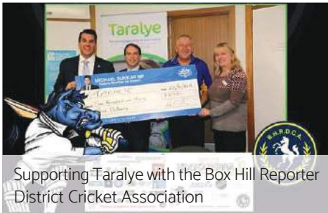
Supporting Taralye with the Box Hill Reporter District Cricket Association