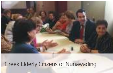
Greek Elderly Citizens of Nunawading