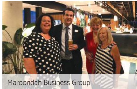
Maroondah Business Group