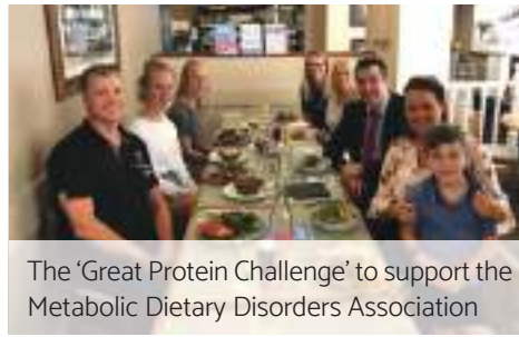
The 'Great Protein Challenge' to support the Metabolic Dietary Disorders Association