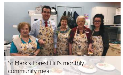
St Mark's Forest Hill's monthly community meal