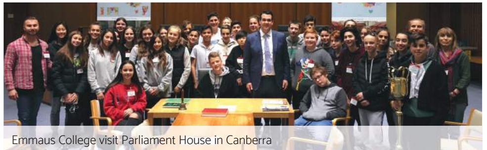
Emmaus College visit Parliament House in Canberra