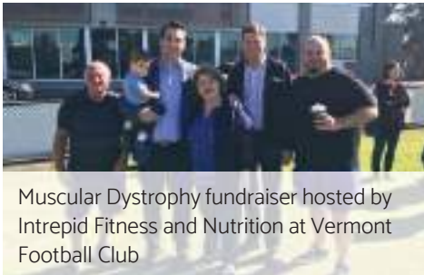
Muscular Dystrophy fundraiser hosted by Intrepid Fitness and Nutrition at Vermont Football Club