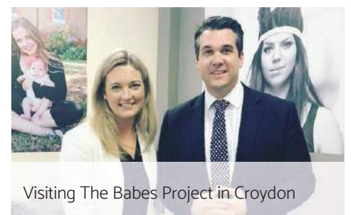
Visiting The Babes Project in Croydon