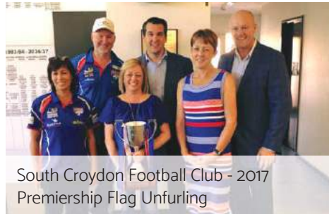
South Croydon Football Club - 2017 Premiership Flag Unfurling