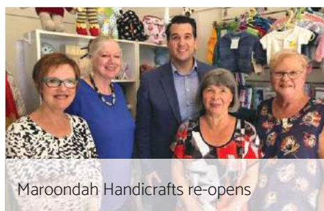
Maroondah Handicrafts re-opens