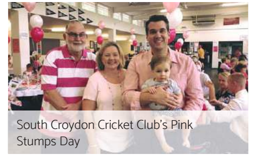
South Croydon Cricket Club's Pink Stumps Day