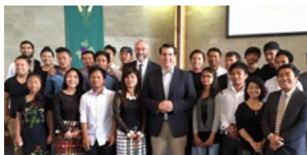
Grace Community Church