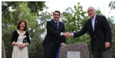
Rotary Club of Ringwood's Peace Garden Opening