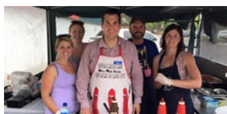
Tarralla Kindergarten Bunnings BBQ