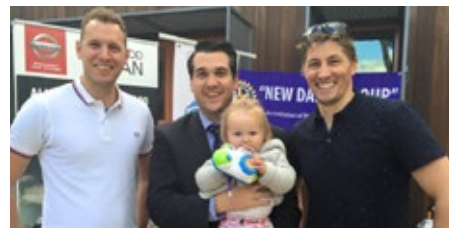
Dads Group Inc