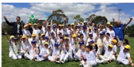
Deakin Community Cup