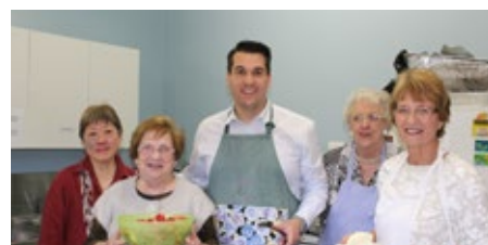
St Marks Anglican Church Community Meal