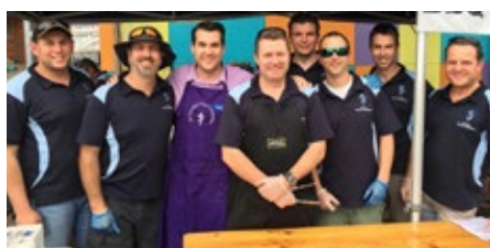
St Timothy's Primary School Fair