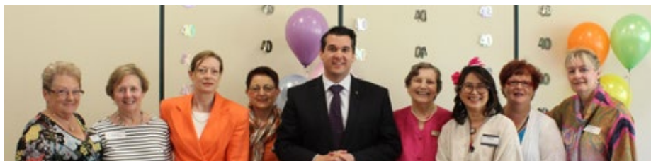
Maroondah Handicrafts 40th Anniversary Celebrations