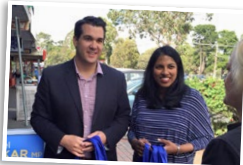
Michael Sukkar MP