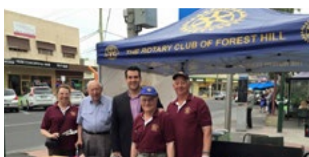
Blackburn Craft Market - Rotary Club of Forest Hill