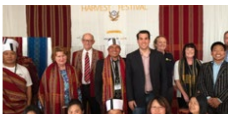
Australian Chin Community Harvest Festival