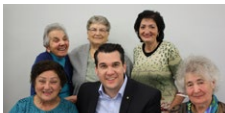
Circolo Pensionati Italian Club Nunawading