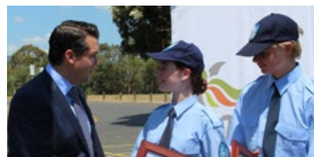
Melba College's Victoria Police Youth Corps Advance Program Graduation