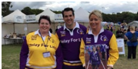
Maroondah Relay for Life