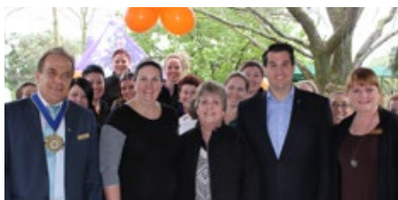
Knaith Road Childcare Centre 30th Anniversary