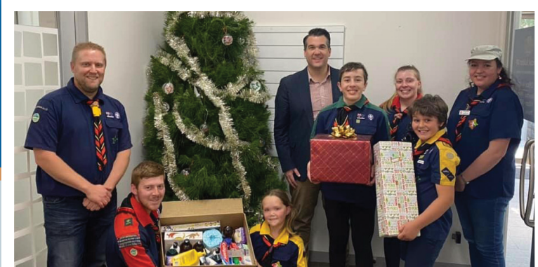
Christmas Giving Tree

I am again asking local residents, community groups and businesses to support the Deakin Christmas Giving Tree by donating non-perishable food items including Christmas puddings and cakes, along with vouchers, children's toys and other essentials such as new clothing, blankets and toiletries. This year the Deakin Christmas Giving Tree will provide much-needed support to local families through the Eastern Emergency Relief Network . Donations can be dropped off at my office in Mitcham or the Bendigo Bank Ringwood East until Thursday, 21 December 2023.