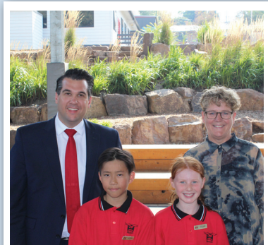
Mullum Primary School