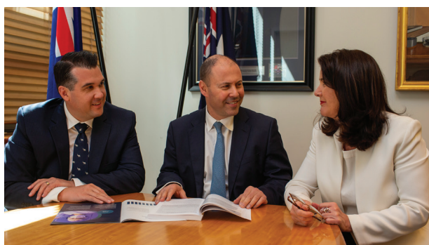
The Treasury Ministers Team preparing for the Federal Budget