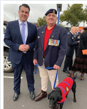
Ringwood RSL ANZAC DAY