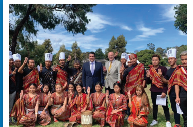
Burma Democracy Support Group