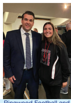
Ringwood Football and Netball Club