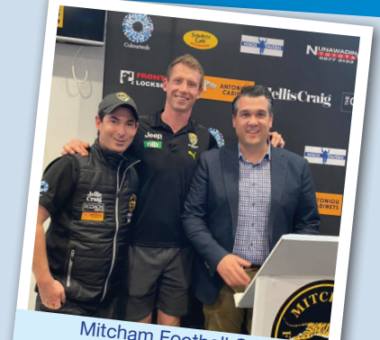
Mitcham Football Club President's Lunch