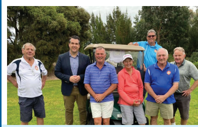
Dorset Golf Club