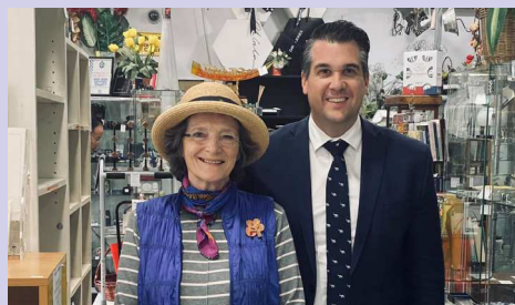
Youth Education Support

Our family really enjoyed the Heathmont 100 Year Family Fun Day. It was a great celebration of Heathmont.