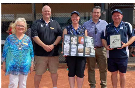
Blackburn Tennis Club

Here I am drawing the first numbers for the Ringwood Cricket Club 'Rams Raffle'.