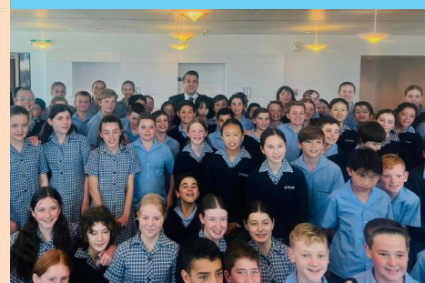
Parliament House School Visit

It was wonderful to welcome students and teachers from Good Shepherd Primary School to Parliament House in Canberra.