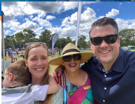
Heathmont 100 Year Family Fun Day

I enjoyed catching up with the Ainslie Park Cricket Club and the East Ringwood Junior Football Club to check out their brilliant new facility. It was great to work with these clubs to kick-start the project with funding back in 2018.