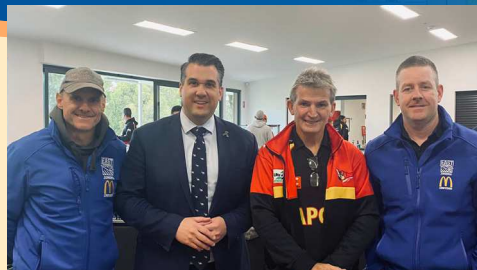
Ainslie Park Cricket Club

I enjoyed catching up with the Ainslie Park Cricket Club and the East Ringwood Junior Football Club to check out their brilliant new facility. It was great to work with these clubs to kick-start the project with funding back in 2018.