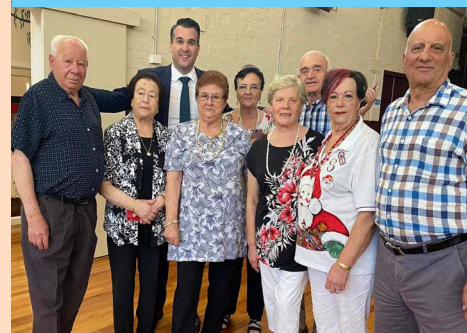
Italian Senior Citizens Club

It was great to join in on the Christmas celebrations with the Italian Senior Citizens Club of Maroondah.