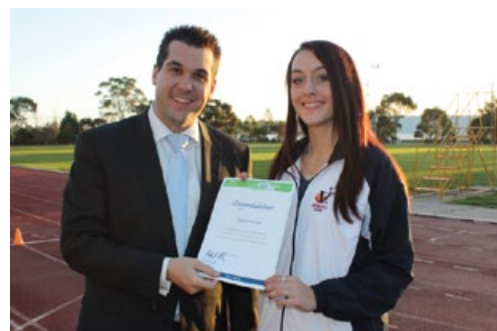
Michael Sukkar MP