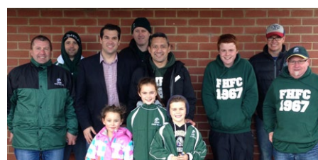
Forest Hill Football Club