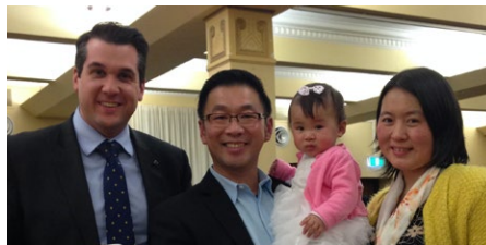
Whithorse Citizenship Ceremony