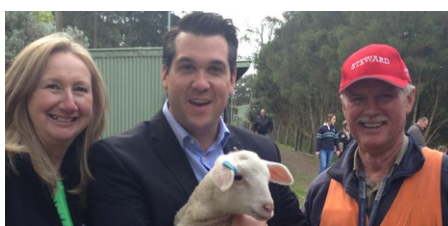
Tintern Friends of Young Farmers Spring Celebration