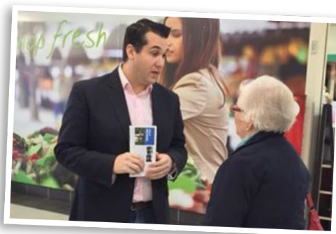
Michael Sukkar MP