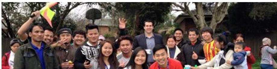
Chin Community of Victoria Family Fun Day