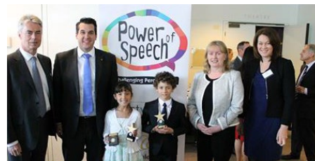
Taralye Power of Speech