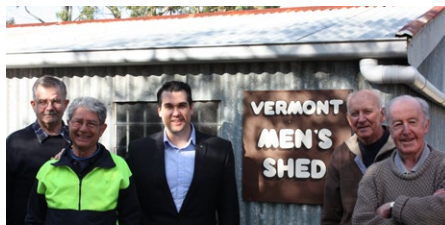
Vermont Men's Shed