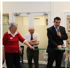
Forest Hills Retirement Village