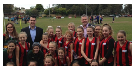
Blackburn Girls Football