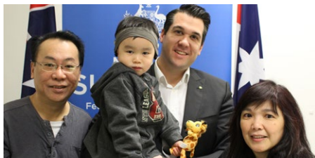
National Hearing Week