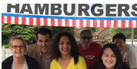
Mitcham Primary School fete