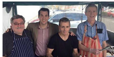
Big Aussie Barbie for Prostate Cancer