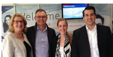
Crossway Baptist Church