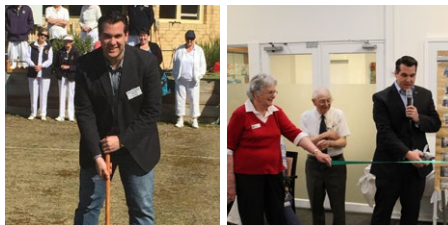
Ringwood Croquet Club season opening