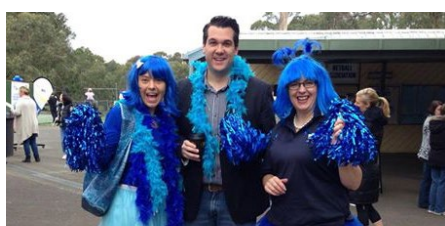
MENA Blue Day