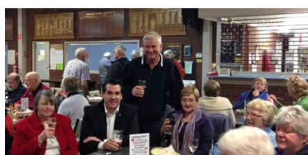
Heatherdale Bowls Club