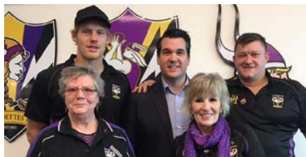
Norwood Football Club