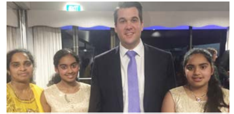
Maroondah Citizenship Ceremony