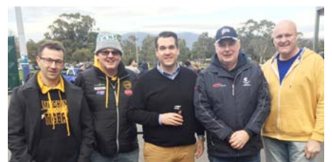
Mitcham v Croydon Footy Match