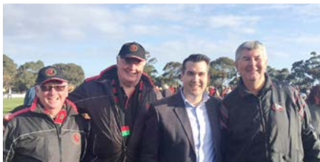
Aquinas Old Collegians Grand Final Day