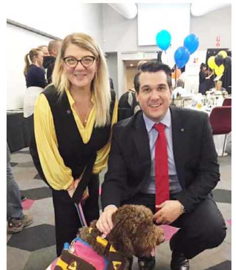
Irabina Autism Services Grand Final Fundraiser