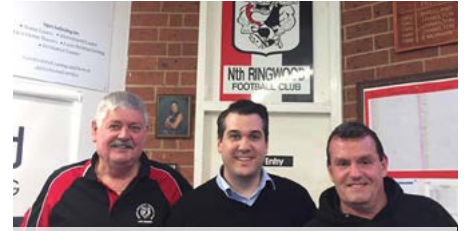
North Ringwood Football Club