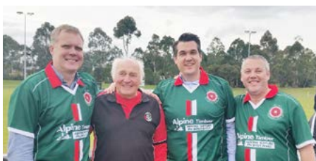
Croydon City Arrows Club's 60th Anniversary