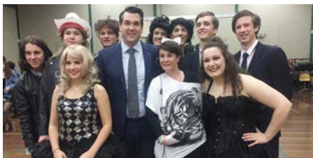
Melba College's Rock of Ages production