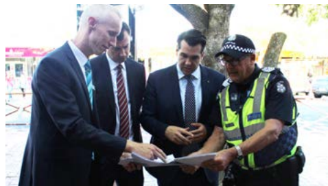
Michael Sukkar MP

As always if you have any feedback or questions, please contact me via email at Michael.Sukkar.MP@aph.gov.au or call my office on 03 9874 1711.