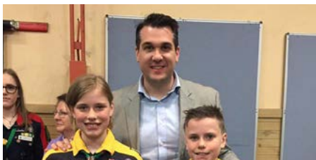
Maroondah District Scouts