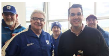
East Ringwood Football Club