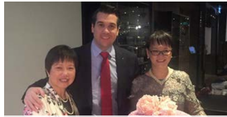
Chinese Women's Association of Victoria 30th anniversary