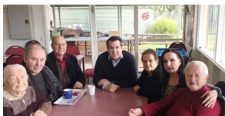
Italian Senior Citizens' Club of Croydon