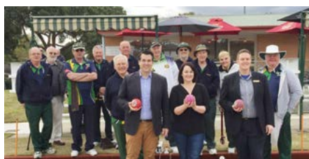
Ringwood Bowls Club season opening