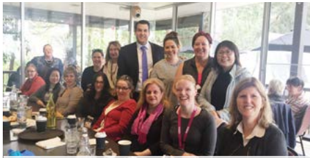
Different Journeys' Pathway for Carers project