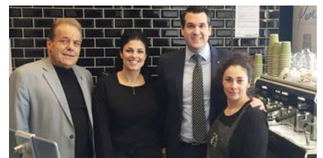
New Croydon business, TJ's on Main