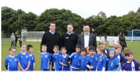
Box Hill United Soccer Club Game