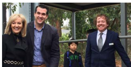
Marlborough Primary School 40th anniversary