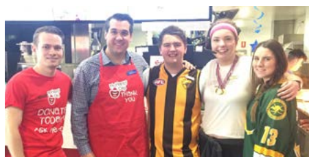
McHappy Day in Ringwood