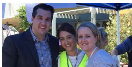
Great Ryrie Primary School fete