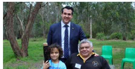
Blackburn Lake Sanctuary Cultural Day