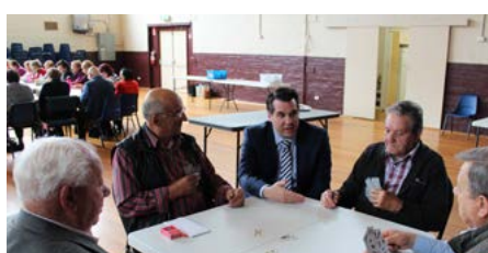
Maroondah Italian Senior Citizens