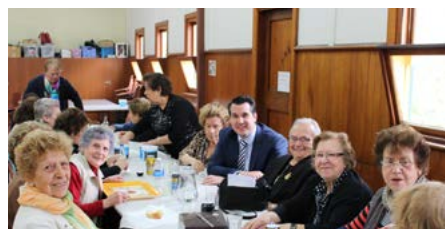
Greek Elderly Citizens of Nunawading