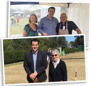
Community Action Group to facilitate a discussion on local homelessness