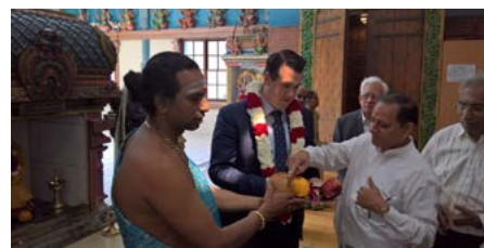
Sri Vkrathunda Vinayagar Hindu Temple