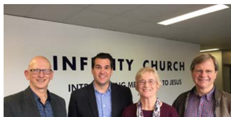
Infinity Church Ringwood