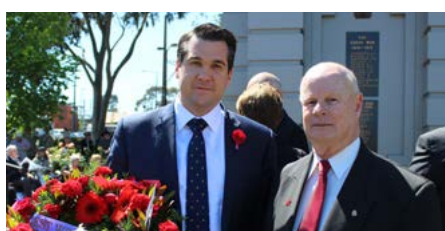
Remembrance Day at Ringwood RSL