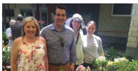
St John's fete