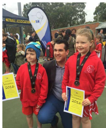
Melbourne East Netball Association presentation