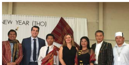
Chin New Year Festival