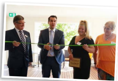
Michael Sukkar MP