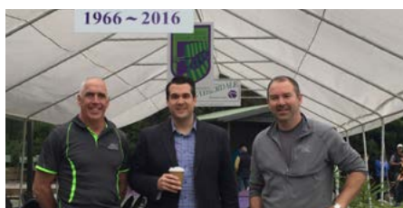
Heatherdale Tennis Club 50th anniversary