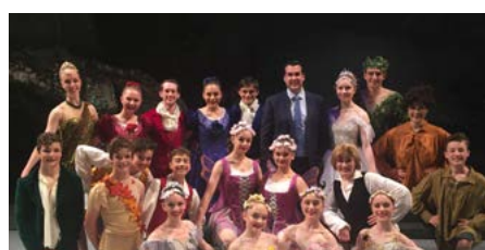
Ringwood Ballet Group's A Midsummer Night's Dream