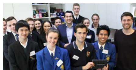
Student Leadership Roundtable