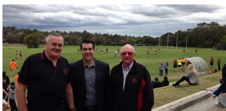
No 1 Ticket Holder at Aquinas Old Collegians FC