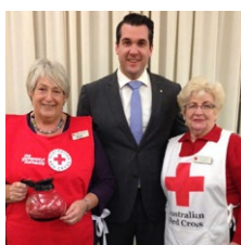
Blackburn Red Cross