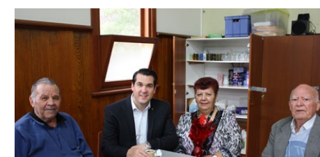
Greek Elderly Citizens Club of Nunawading