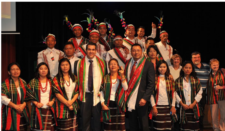
Australian Zo Organisation's Cultural Show at Ringwood Secondary College