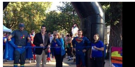
Cutting the ribbon at the Irabina Autism Services Superhero Fun Run