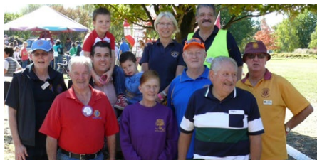
Combined Rotary Clubs of Whitehorse Fair