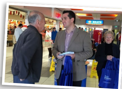
Michael Sukkar MP