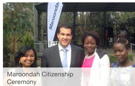
Maroondah Citizenship Ceremony