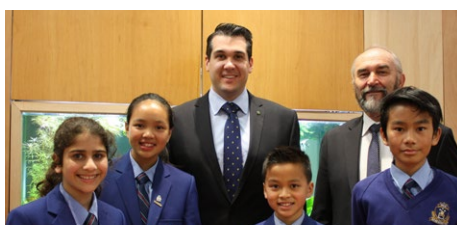
Opening of refurbished building at Nunawading Christian College - Primary