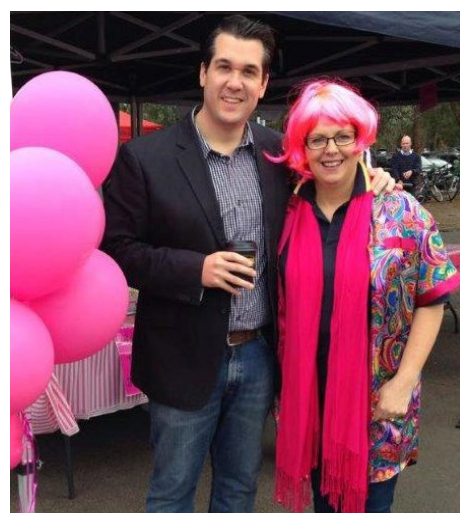
Melbourne East Netball Association's Pink Day to support Breast Cancer Network Australia