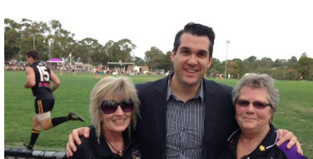
Norwood Football Club's season opener