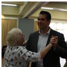
North Ringwood Senior Citizens Centre