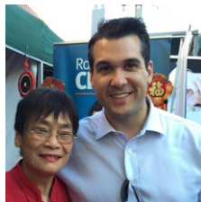
Whitehorse Chinese New Year Festival