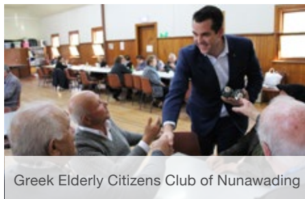
Greek Elderly Citizens Club of Nunawading