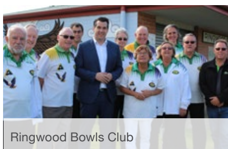
Ringwood Bowls Club