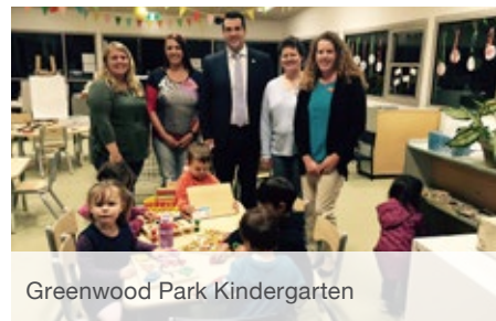
Greenwood Park Kindergarten