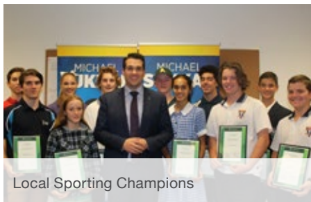
Local Sporting Champions