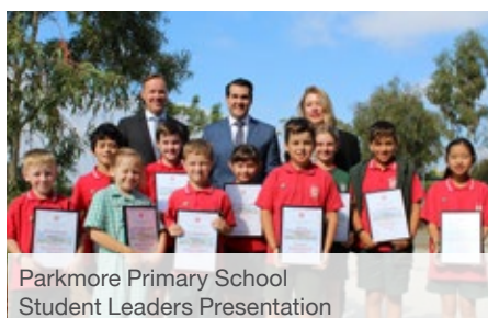
Parkmore Primary School Student Leaders Presentation