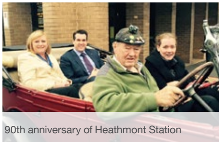
90th anniversary of Heathmont Station