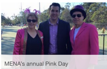
MENA's annual Pink Day