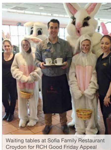
Waiting tables at Sofia Family Restaurant Croydon for RCH Good Friday Appeal