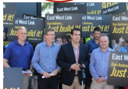
Michael Sukkar MP