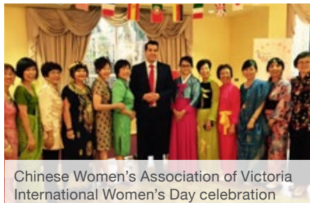
Chinese Women's Association of Victoria International Women's Day celebration