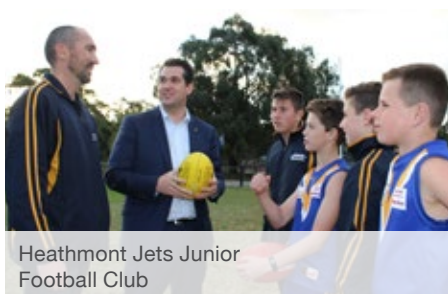
Heathmont Jets Junior Football Club