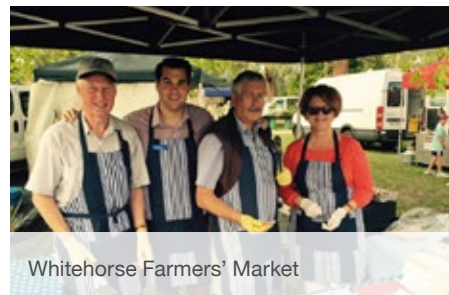
Whitehorse Farmers' Market