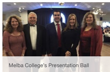
Melba College's Presentation Ball