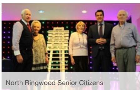
North Ringwood Senior Citizens