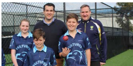
Vermont South Cricket Club