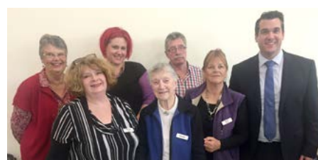
Maroondah Community Assist