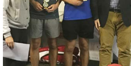
HE Parker Tennis Club Championships