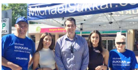
Listening Post - Ringwood East