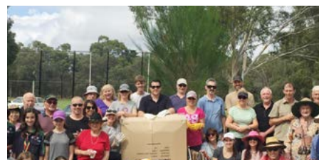
Clean Up Australia Day