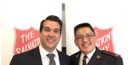
Salvation Army Multicultural Launch