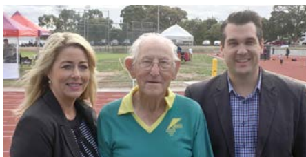
39th City of Maroondah Athletics Carnival