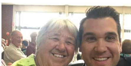
Heatherdale Recreation & Bowls Club