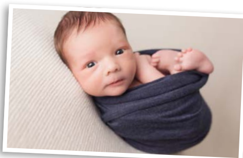
Michael Sukkar MP