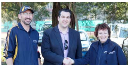
Heathmont Jets Junior Football Club