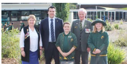
Croydon Primary School ANZAC Plinth