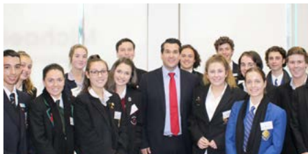
Student Leadership Roundtable