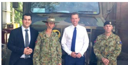
22nd Engineer Regiment with Minister for Defence Personnel the Hon Dan Tehan MP