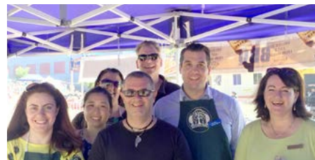
Antonio Park Primary School Fete