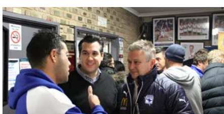
East Ringwood Junior Football Club