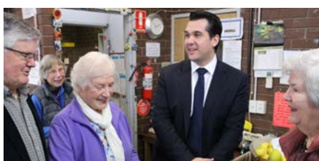
Heathmont Interchurch Help Op-Shop