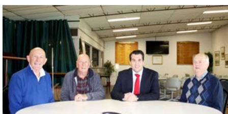
Mitcham Bowling Club